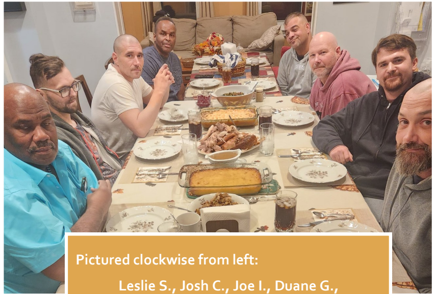
Pictured clockwise from left: